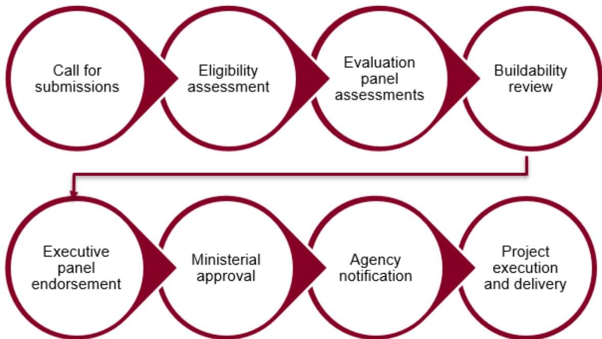
Figure 1: Eight step submission process