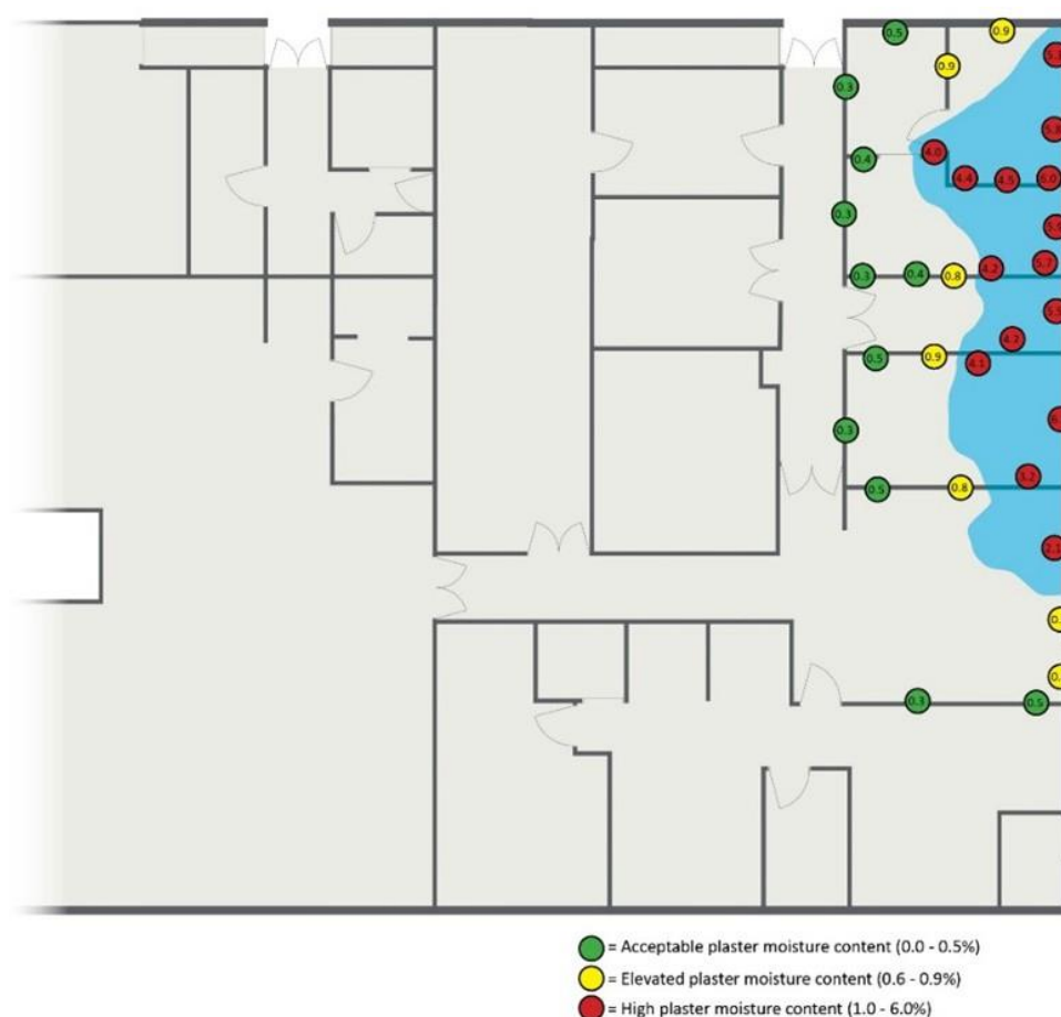
Figure 1: Moisture readings shown on a floor plan

Moisture readings should be included in the initial assessment report, outlining the scope of the damage. Additionally, it is valuable to visually represent moisture readings on a floor plan ( Figure 1 ) to visually.